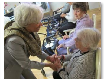
PRaise & WORSHIP OUTReACH