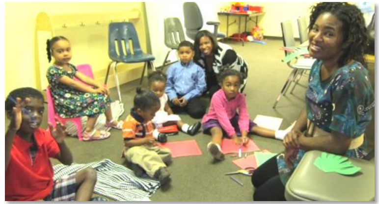
Juniors and Beginners/Kindergarten teachers engage students through interactive, creative activities as well as biblical object lessons.