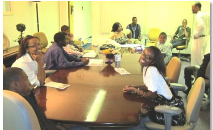
Primary and Youth classes challenge students to think about life implications and applications during their lesson discussions.